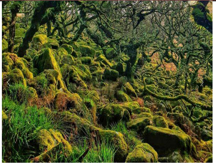
Wistman’s Wood, Dartmoor. One of Britain’s few remaining fragments of temperate rainforest.